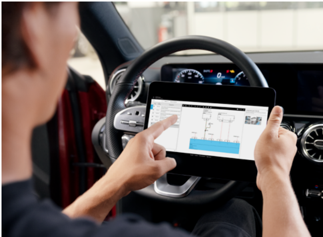
Customized information in a matter of seconds: Thanks to the vehicle identification number(FIN)-specific display of the Dynamic Wiring Diagram, solely the wiring diagram relevant for their vehicle is shown to the user.