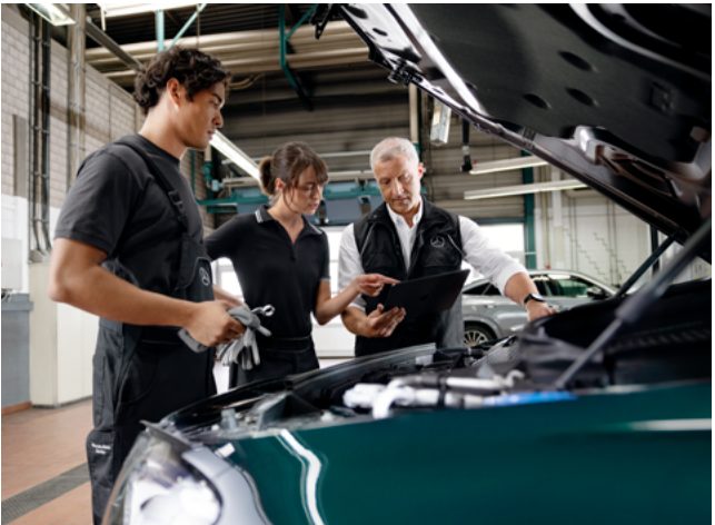
With the latest technology, you can search in a quick, intuitive and quick manner – Profit from XENTRY WIS in your workshop process.